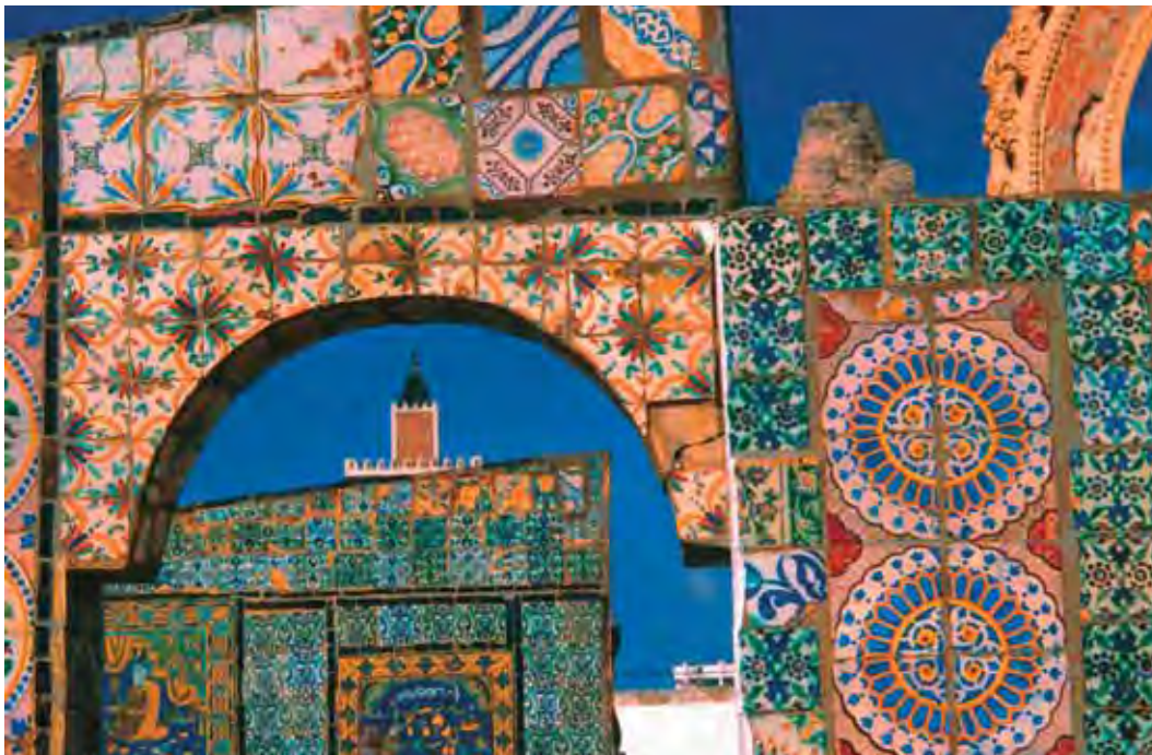
Tiled ruins of the Terrace du Palais d'Orient, Tunis, Tunisia

BL009 Departs 12 May 2008 / From Bristol/Gatwick/Manchester/Stansted / 10 nights / Prices from £1,092