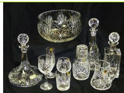
THE CRYSTAL COLLECTION

Please see the below for the latest list of our winners in ship and cruise order.