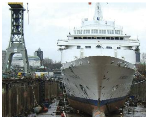
Black Watch's sister ship, Boudicca, in dry dock