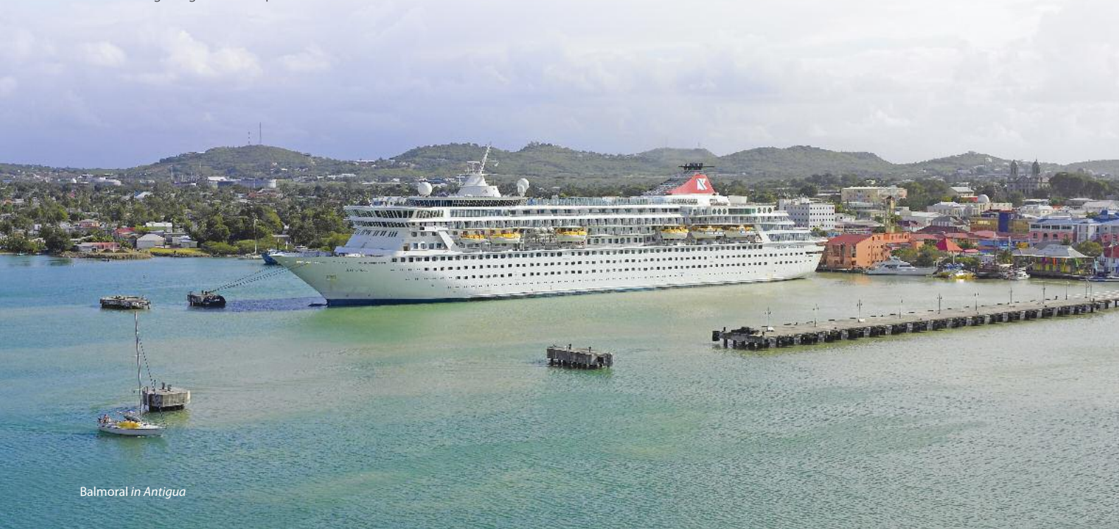
Balmoral in Antigua

Please note: Those wishing to take part in the bridge sessions must pre-book and there is a charge of £100 per player. Those not participating will be unaffected by proceedings and all other activities will proceed as usual.