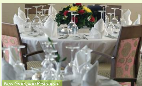
New Grampian Restaurant