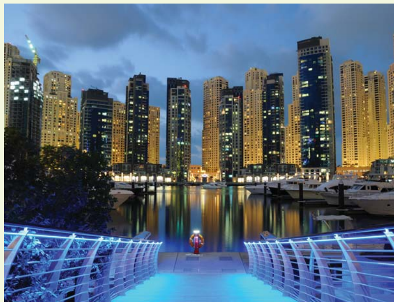
Dubai Marina at night

Full details of these fantastic sailings will be sent to you in our Grand Voyages brochure before the on-sale date of Tuesday 12 th May. Individual cruise sectors may be Advance Registered using the form enclosed with this issue of Cruiselines.