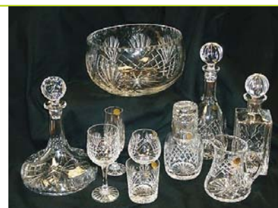
THE CRYSTAL COLLECTION

Please see the below for the latest list of our winners in ship and cruise order.